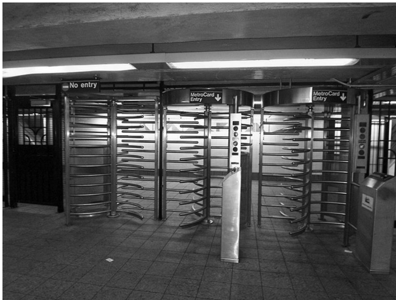
Figure 2.2 The card-operated turnstiles at a New York City subway terminal is one example of access control.