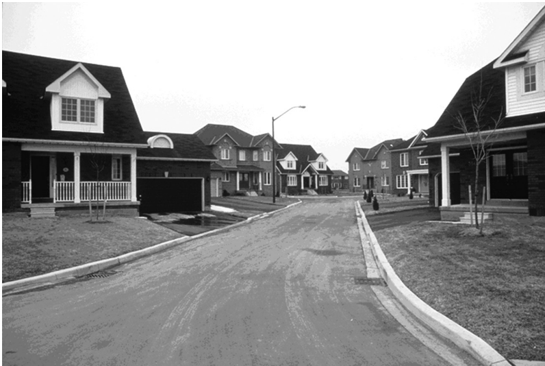
Figure 2.6 Trelawny neighborhood.