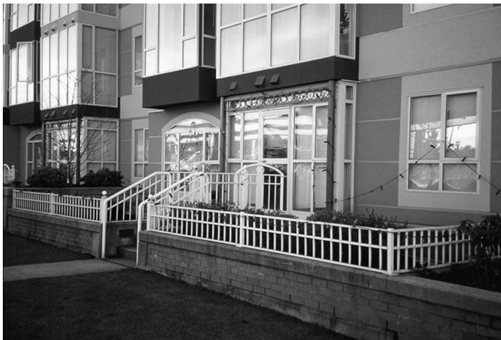
Figure 2.3 The façade of a ground-level suite at Collingwood Village in Burnaby, British Columbia, Canada.