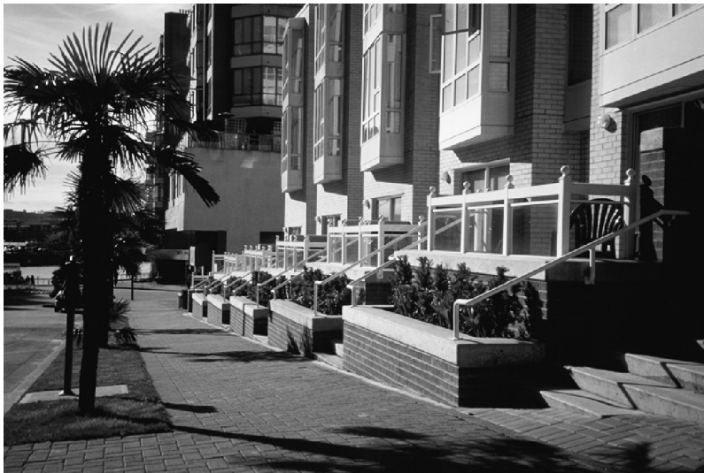
Figure 2.4 Ground-level townhouses along Beach Avenue.